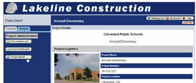
Access your project plans from the DFS Online Plan Room and download them into your electronic takeoff tool

Online takeoffs allow estimators to work faster and more efficiently. Area calculations, linear measurements, and unit counts can be quickly calculated electronically and saved for later review.