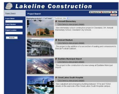
Documents and projects are displayed in the customized Online Plan Room

With DFS Contractor's Instant Print System, project team members can have plans in their hands in a matter of seconds. You can simply send them a notification when new documents are available. They click the link in the notification to go to the Online Plan Room and view the documents. Once there, they can click the "Print" button to print them instantly to a printer sitting in their office. No more waiting for overnight shipping!